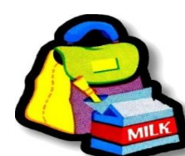
Line 4- Fast & Fresh