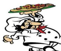
Line 3- La Pizzeria