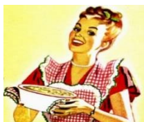
Line 2- Taste of Home