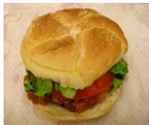
Line 1- Big R Grill