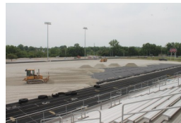
Above: Richmond High School Football Field